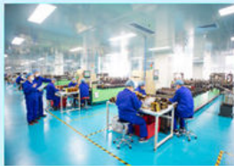
7. Bag Making