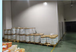
2. Material IQC