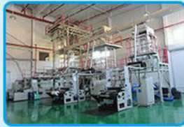
1. Film Blowing

CONFIDENCE COMES FROM PROFESSIONAL QUALITY WIN THE TRUST