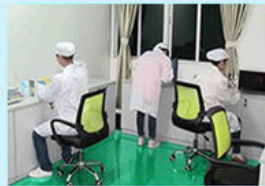
8. QA Test